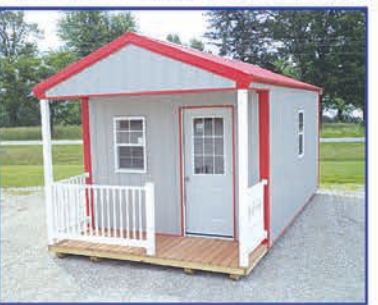
12' X 24' Metal Cabin