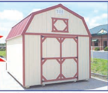
12' X 16' Lofted Barn