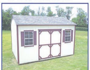
10' X 16' Garden Shed