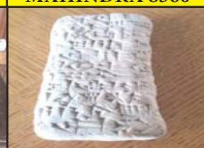
JAPANESE SAMAURAI SWORD SUMARIAN CLAY TABLET