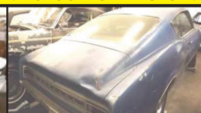
1964 1/2 MUSTANG '69 MERCURY CYCLONE