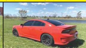
2016 DODGE CHARGER HELLCAT