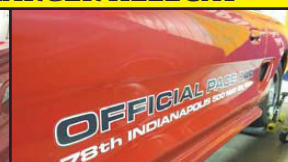
FORD MUSTANG 78TH INDIANAPOLIS OFFICIAL PACE CAR