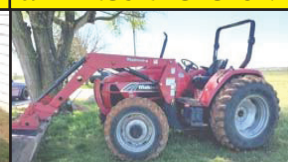
'84 CORVETTE MAHINDRA 8560