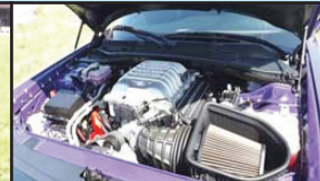
2018 DODGE SRT DEMON