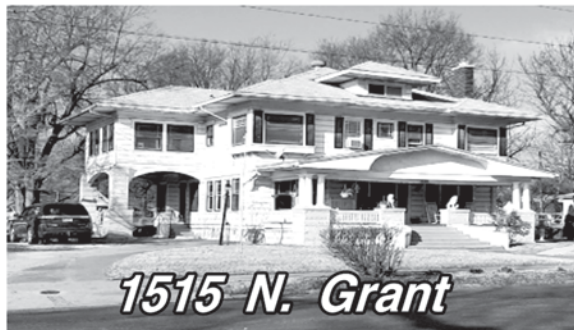
1515 N. Grant