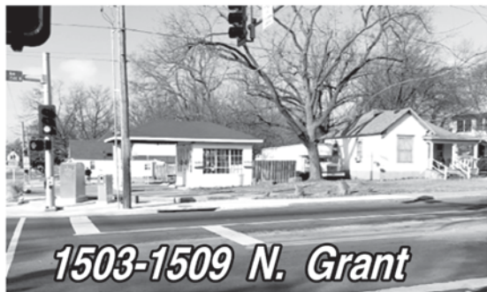
1503-1509 N. Grant