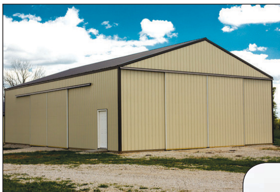
Custom Homes • Metal Roofs