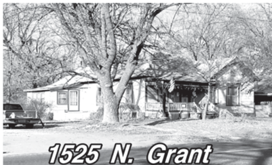
1525 N. Grant