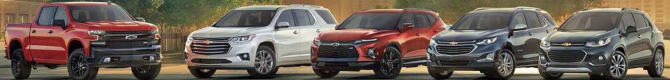
2020 SILVERADO 1500 CREW CAB STK# 33135